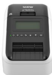
Professional QL Labellers