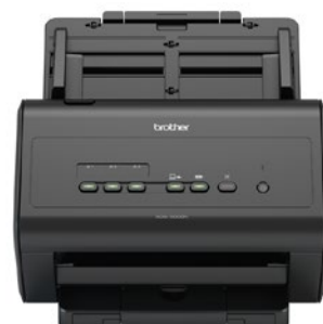
Business Document Scanners