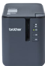
High-Volume Office Labellers