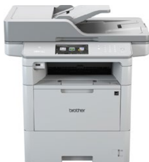
Professional Monochrome Laser Devices