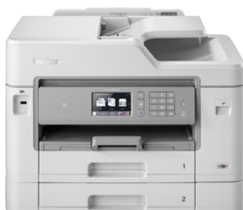
Business Inkjet Devices