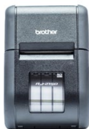
Rugged Receipt and Label Printers